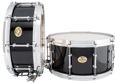
OG Black Cortex

Replace __ with color code listed below.